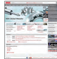
NSK's website http://www.nsk.com/